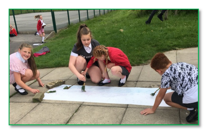
Year 6 painting using natural resources